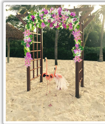
Love at first flight

One of our most popular destinations, Stingray City was haunted by several renegade sharks this past weekend. Snorkelers were caught off-guard by these vicious predators and quickly swam back to their boats. What is typically a calm sight-seeing adventure turned out to be terror-filled. Fortunately, no one was injured, but we're not sure if any will return